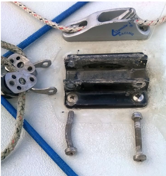
Original step with machine screws removed - the front one gets the load!

The following shows the process as carried out on a used Laser 2.