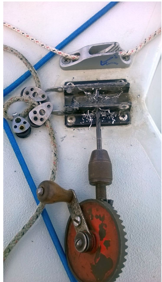
Drill through 5mm dia. mid-way between original holes

Drilling a pilot hole first will help, as will using a low profile hand drill to save having to remove the step from the deck.