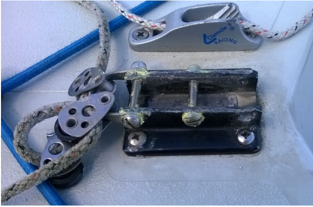
Fitted with new machine screws - bolts would have been better...